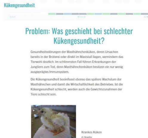
Fig. 2: Detailed description about health problems with young chicks.