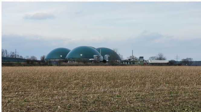
A biogas plant

Important sources of methane emissions are liquid manure and the storage of manure. Nitrous oxide is mainly produced by spreading nitrogen-containing mineral fertilizers and manure. Transferring broiler manure to a biogas plant, rather than storing it, is one way to reduce these emissions and thus improve the sustainability of keeping and production of broiler chicken.