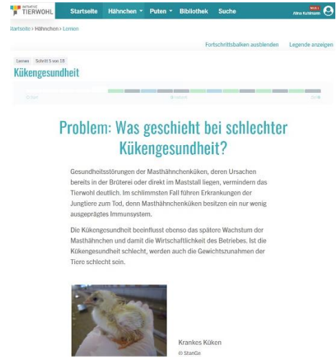
Fig. 2: Detailed description about health problems with young chicks.